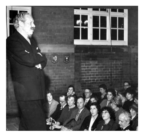
389 people attended at Judd School in October 1963 to hear Sir Mortimer Wheeler on 'Digging up history'.

Several study groups were formed. They included a 'Photographic Studies' group, which still flourishes as the 'Pictorial Records' group.