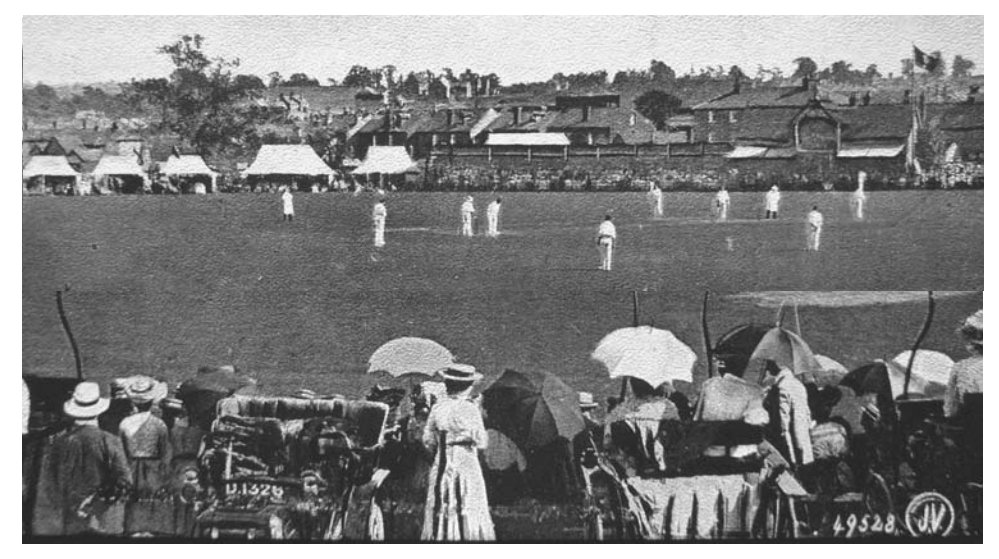
County Cricket on the Angel Ground, early 20<sup>th</sup> century. The wicket was roughly where the (west) entrance of Beales is today.

for many regard the Week as one for holidaymaking and we feel our first duty is to congratulate all concerned upon having successfully steered the event through a period of years until it has attained its majority'.